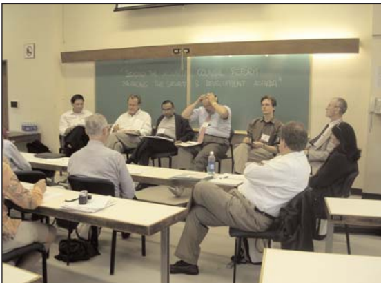
Photo of the event.

27-31 May, Montreal, Canada MIF (Montreal International Forum). Blue Mountain Global Governance 2005 Seminar. Organisation of event