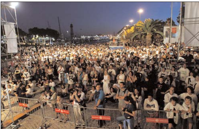
Photo of the event.

10 September, Barcelona White March: Let's Eradicate Poverty and Reform International Institutions