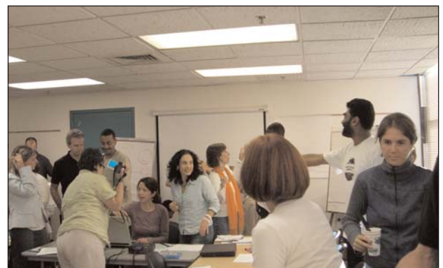
Photo of the event.

17-18 September, New York, USA GCAP IGF meeting