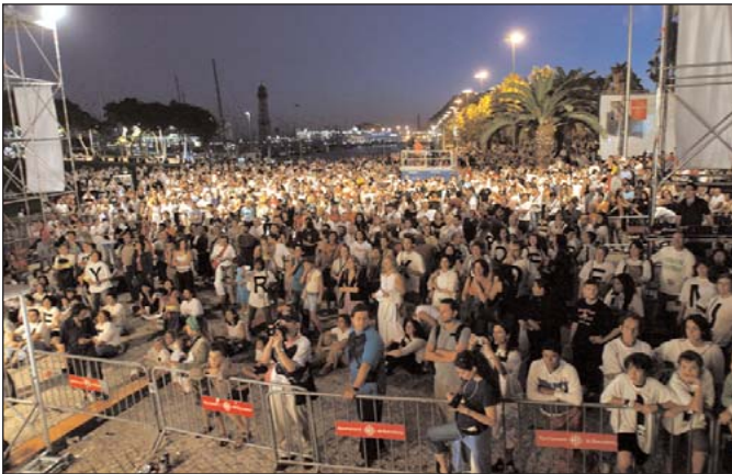
Photo of the event.

10 September, Barcelona White March: Let's Eradicate Poverty and Reform International Institutions