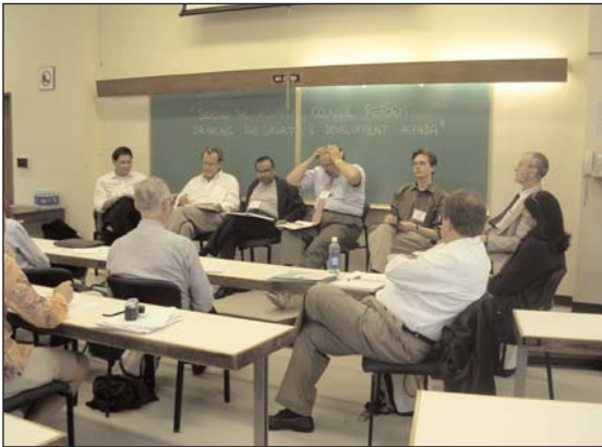
Photo of the event.

27-31 May, Montreal, Canada MIF (Montreal International Forum). Blue Mountain Global Governance 2005 Seminar. Organisation of event