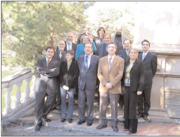
Photo of the group.

14 January, Barcelona Founding meeting of the UBUNTU Foundation Trust