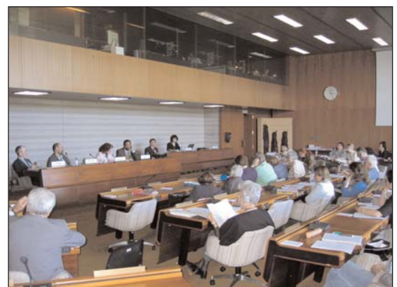
Photo of the event.